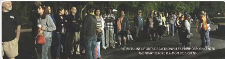
PATIENTS LINE UP OUTSIDE JACKSONVILLE'S PRIME OSBORN CENTER THE NIGHT BEFORE FLA-MOM 2016 OPENS.

Nearly two-thirds of patients reported "being in pain," with 33% in pain for more than a year.